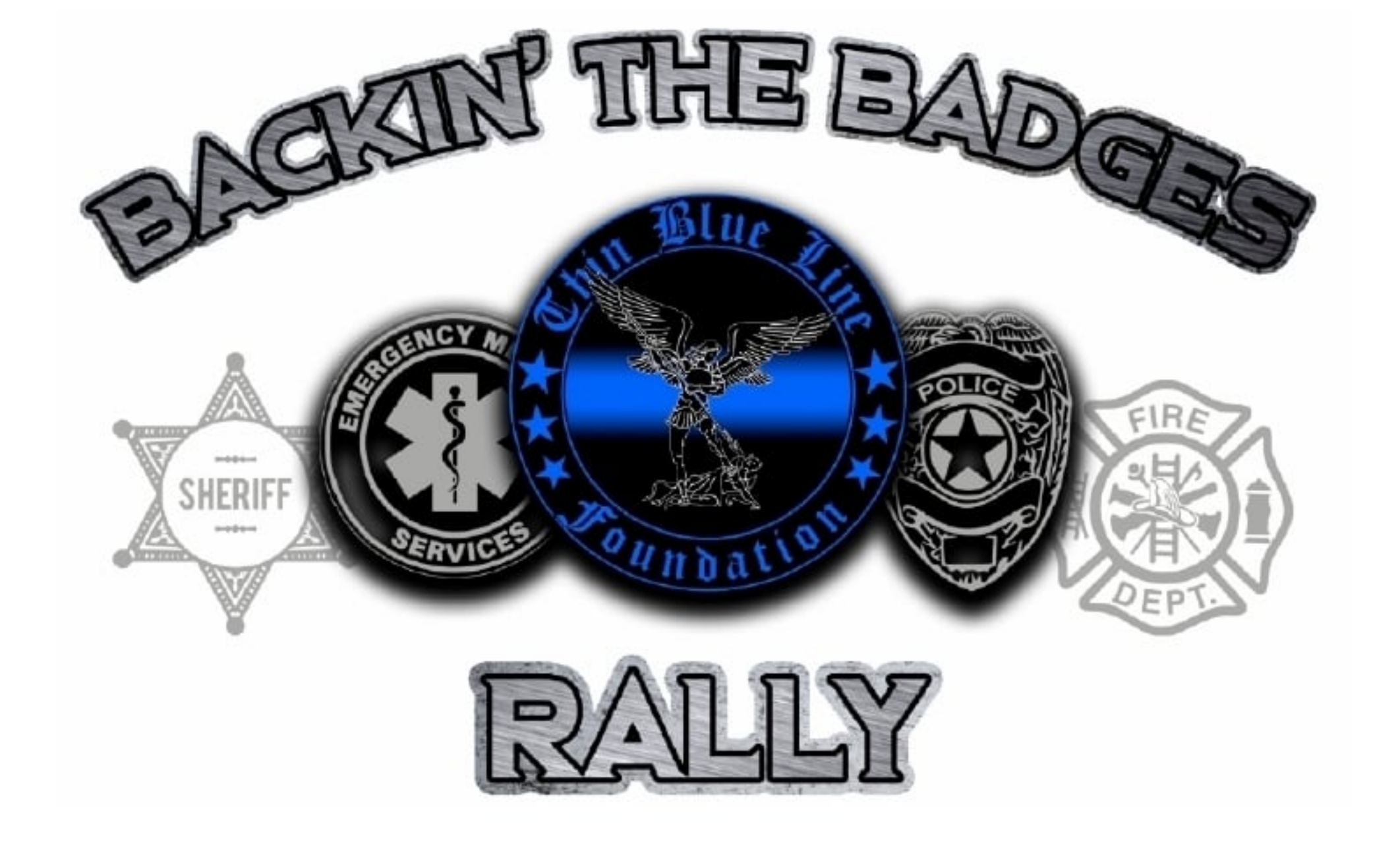
September 3 & 4, Fisherman's Park, Bastrop, Texas